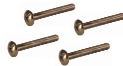
M4 x 30L Screw * 4