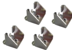
Panel clip * 4